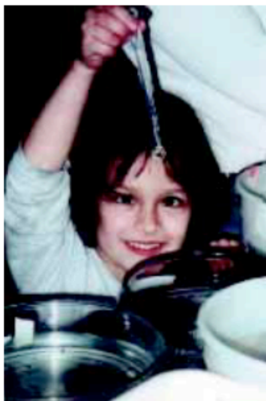
Fig. 1. A five year-old child, observing the living axolotl embryo at the IU Axolotl Colony.

Live material with accompanying supplies can be obtained from various biological supply companies (e.g., NASCO Scientific, Ward's Biological Supply, Carolina Biological). Many materials can be obtained locally or even collected from nature (at no cost). Supporting materials and activities for classrooms can usually be found on the Internet. The teacher doesn't have to take a course to teach with these materials. They can choose to learn with their