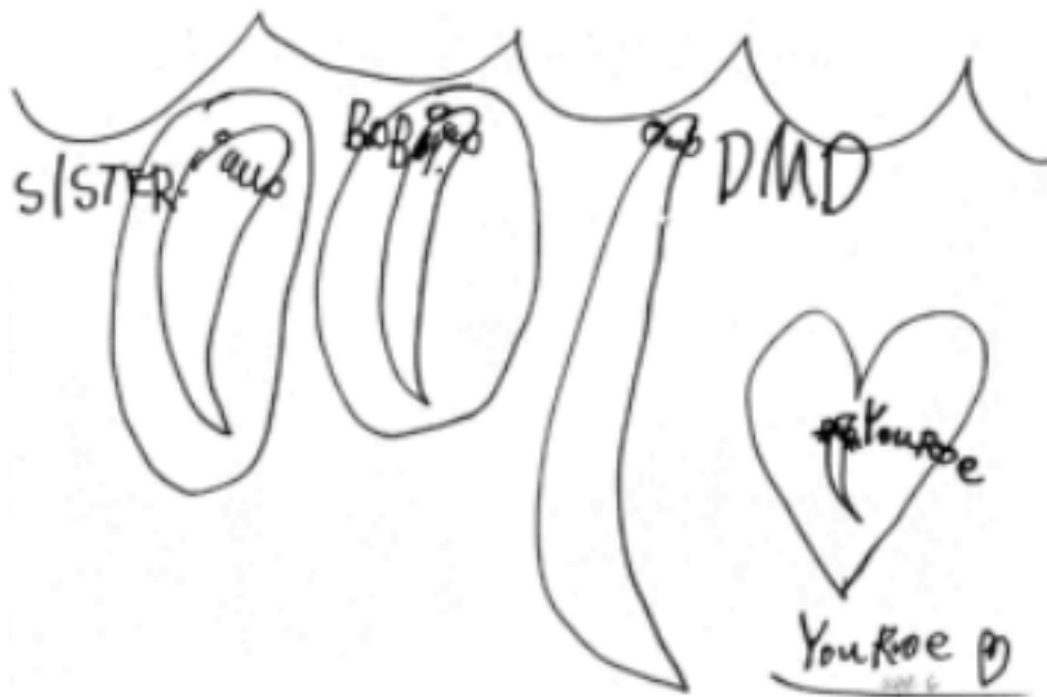
Fig. 4. Graphic representations by preschoolers tell us much about their abilities to observe and relate to their world. Here, not only do we see surprisingly accurate drawings of developing axolotl embryos, but you see that the child is involved with that world as part of her own. Sketch courtesy of Sue Hicks and Jitka Horne, Hoosier Courts Cooperative Nursery School.

and their classrooms have been reported in their local newspapers. Other teachers from the schools or the region would contact those teachers or the colony so that they could do the same thing in their own classrooms. Such is the effect of natural science, and, in this case, of axolotls, on stimulating interest in students, their families, and teachers.